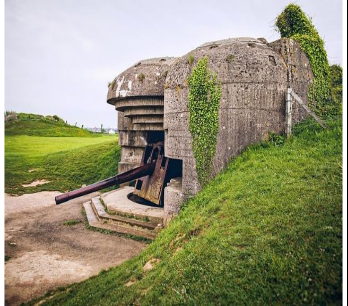
German battery at Longues-sur-Mer, Normandy