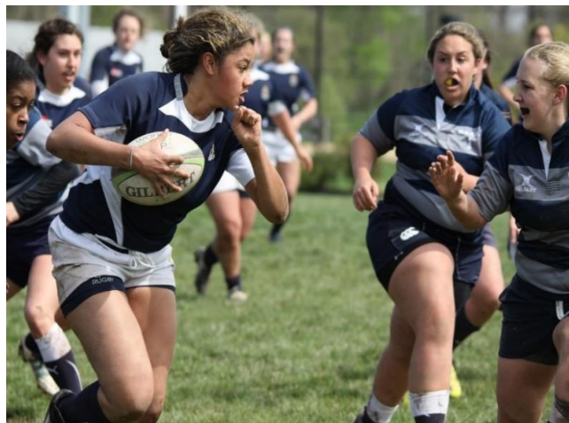
This is not Marley Packer !

Marley Packer , the captain of the England Women's Rugby Union team, who trained as a plumber, first played the game when she was eleven. At her club, the Boys' under 12 team was short of a player and Marley was asked to play. As she ran on to the pitch a boy in the opposing team shouted “ eh look, they got a girl playing for them. ” Marley stopped, looked him in the eyes and said, “ I'll remember you “. Half-way through the first half she tackled the boy, and flattened him. When he eventually got up he was crying . His mother ran on to the pitch and complained loudly that such a tackle should not be allowed and took her son out of the game. Marley went on to play for her country and is now England's captain. Her team is currently undefeated ! England's Women won the Six Nations again by beating France 42 – 21 last Saturday, in France. “I'm glad I gave up playing rugby for the Under 80s !” MW