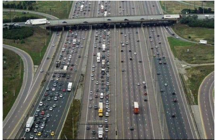
The widest motorway in the world is located in Ontario, Canada. At its widest point, this highway has 22 lanes.