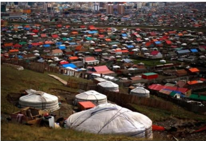
75% of the Earth's population has no postal address.