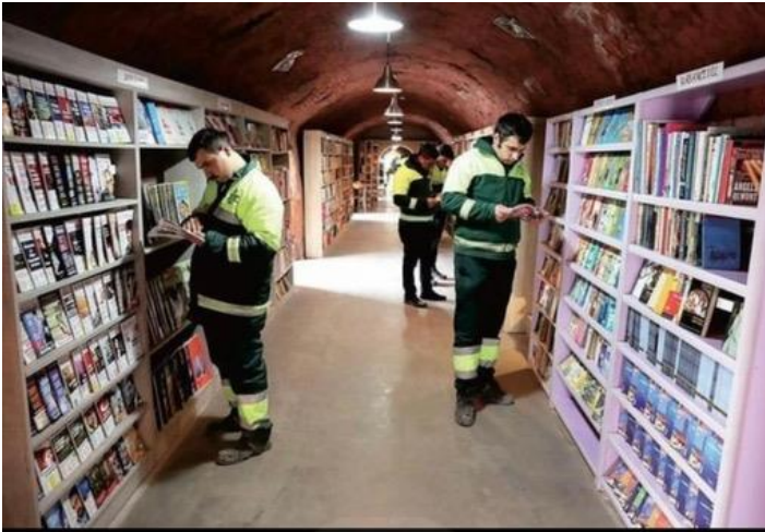
Turkish garbage collectors opened a library with all of the books people throw out in their trash.