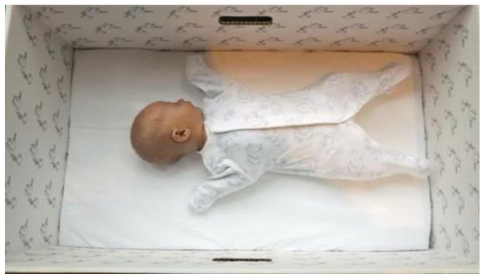
In Finland, New born babies are sent home with a box containing 60 essential items, including clothes, blankets, toys, a book and bedding. The box itself can be used as the baby's first crib.

Best wishes to those members and partners of Arundel Probus Club who cannot make it to meetings or lunches. We miss you and hope you continue to enjoy reading this newsletter. As we start a new club year there are seven or eight of you out there and we would love to hear from you so please drop me a line if you can, or ask someone else to do so for you. There's room here for all your responses. Lions clubs have a lovely expression for non-attending members. They call it "being at large". Perhaps we should borrow it.