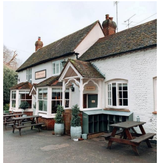
The George, Burpham

August Regular Meeting – Thursday 25 th The owls and their friends are finally coming. Don't be afraid. It's all quite safe, I have been assured, so come and enjoy a rare spectacle and admire these beautiful creatures..