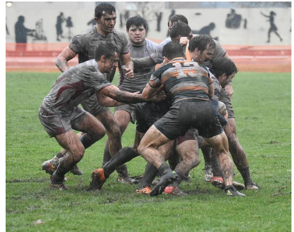
p.s. South Africa will win.